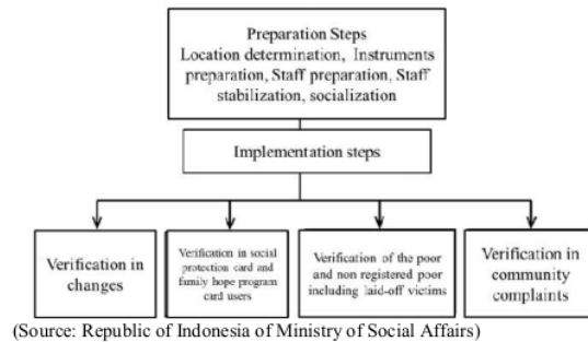
Figure 1. Model of Verification and Validation

The Implementation of Public Policy George Edward III: Implementing a policy is the culmination of a regulation or policy was made. The general implementation stages how a policy that becomes an answer to the problems experienced by the community is applied to the maximum and can answer these problems. However, the implementation stage is not an easy part. Policy makers need to see and develop a good strategy so that the policies that are made can work well.