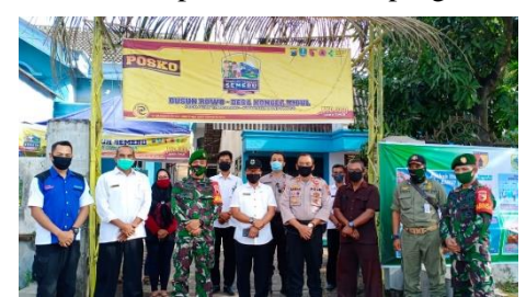
Fig. 1. Posko Tangguh Village, Rowo Hamlet, Koncer Village.

In Indonesia, some people carry out a number of activities that are considered to be able to reduce the risk of covid-19 transmission. One example is the Kampung Tangguh Semeru program which was initiated by the East Java Regional Police. This activity is a form of social care activities. This program seems to have been carried out in a number of areas outside East Java. Kampung Tangguh, which is held in the city of Bondowoso to be precise in Koncer Village, is also running well. This program is implemented in various villages in the city of Bondowoso. Initially, the appearance of this program was not well received by the Bondowoso community. So that for the sake of this program, the local government of Bondowoso and the regional government of East Java made a plan so that this program could run.