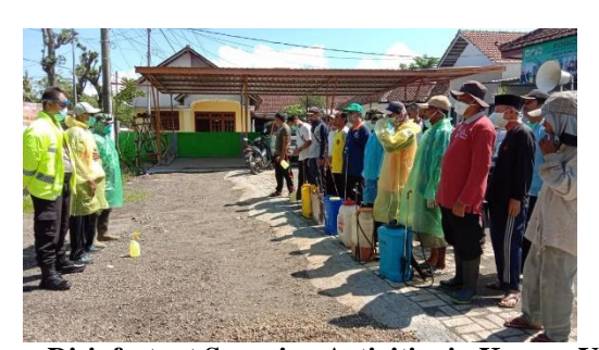
Fig. 2. Disinfectant Spraying Activities in Koncer Village

This program has been running since the pandemic started until now. This program has been running since Kampung Tangguh was not initiated. The initiators of this program were village youths or Youth Organization which had the name Bro and Sist Rowo. Youth from Karang Taruna only continued programs that had been made previously outside the interests of Kampung Tangguh. In fact, the five programs received positive responses from village officials to the surrounding community and were considered effective in reducing the effects of covid-19 transmission.