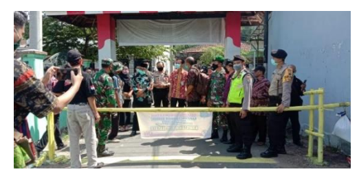
Fig. 4. The Covid-19 Doorstop in Koncer Village.

In the case of this Muslim mother, she chose to undergo independent isolation. This made the village volunteers work extra hard. Every week, the volunteers go to every RT in Rowo Hamlet, Koncer village, to carry out routine spraying and accommodate if there are residents who want to donate materials to help relieve families who are affected by disaster.