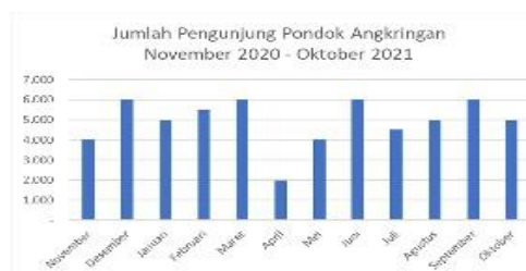
Figure 1 Data of Pondok Angkringan

The researchers were Kurniawati and Silitonga (2021) and Yucha and Safitri (2020). Meanwhile Andriani (2020) found that store atmosphere had no effect on purchasing decisions. Ma'Ruf Amin 2014 states that the atmosphere of the store is the atmosphere in the store that creates a certain feeling in the customer arising from the use of interior design elements such as lighting, sound system, air conditioning system, and service. Some researchers found that store atmosphere influences purchasing decisions. The researchers were Kurniawati and Silitonga (2021) and Yucha and Safitri (2020). Meanwhile Andriani (2020) found that store atmosphere had no effect on purchasing decisions. Some researchers found that store atmosphere influences purchasing decisions. The researchers were Kurniawati and Silitonga (2021) and Yucha and Safitri (2020). Meanwhile Andriani (2020) found that store atmosphere had no effect on purchasing decisions. Some researchers found that store atmosphere. The shift in lifestyle in the millennial era like today makes young people have a culture of gathering in certain places, such as cafes. Indonesians have a collectivism culture, so they prefer to gather with their community. coffee shop is one of the favorite places for young people to gather. One of coffee shop the choice of young people in Jember is Pondok Angkringan which is located in the middle of the UNEJ campus area.