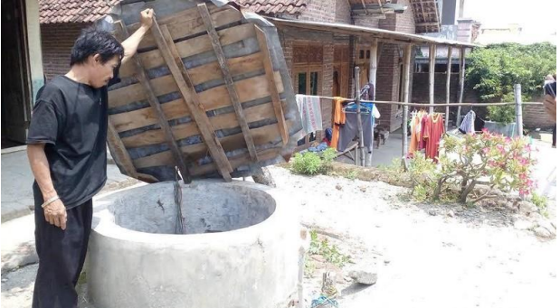
Figure 2. Potential leachate distribution and well monitoring conditions in the field