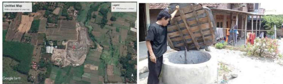
Figure 2. Potential leachate distribution and well monitoring conditions in the field