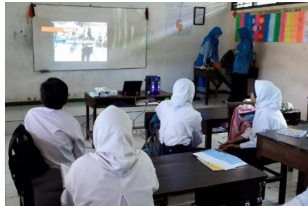
Figure 1. The class situation

program. The material taken from the VOA Learning English program is in the form of video, with a beginner level.