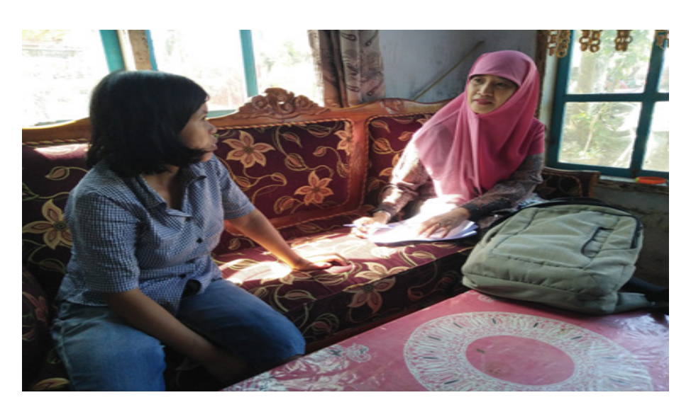
Figure 6. Interview with parent

"I am a girl, when I was a kid, I used to play rubber, bekel, hide and seek, cook, crank, slodoran /gobak sodor, etc., my house is close the field, so it was always crowded. I think the games of my era make us healthier than the games of my children's era because they moved more. Now, I see my child playing video games, he never moves from his seat, it is not healthy. Even though I have a Playstation 2 at home, I cannot play it and I am not interested either. So, it was better and happier when I was little than now."