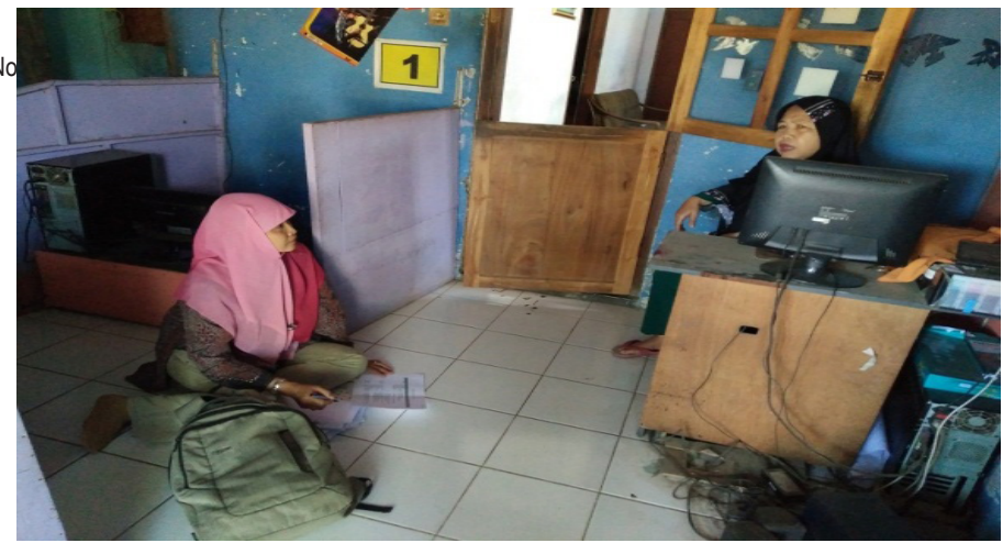
Figure 5. Interview with parent

GN's (33 years) experience of playing traditional games is as follows: