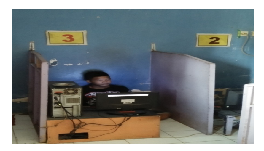
Figure 2. Playing Video game in rental business

In the image, we can see a child playing video games in a rental business house. FA's opinion (13 years old) as follows: