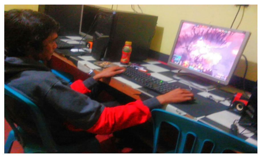
Figure 4. Playing in City

According to Anderson (2010), the effects of short-term exposure, such as playing violent video games for 15 minutes, markedly increased aggressive thoughts and emotions. Increased desire, and several times immediately imitate aggressive behaviour. While the effects of long-term exposure (video game replay) include personality changes, beliefs that aggression is an acceptable way to deal with problems, increased availability of aggressive behaviour, and reduced access to non-aggressive behaviour. Furthermore, in this study it was stated that boys tend to play video games more than girls. And the choice of games tends to be tougher (Moller & Krahe, 2009). Violence in video games does not make boys more violent, and girls more sensitive towards violence (Deselms & Altman, 2003). The conclusion of a study conducted by Kimberly D. Thomas, is that while some individuals may be more at risk for the potential negative effects, people who strongly support traditional masculine norms have the strongest association between video game exposure and violent aggression. Parents should monitor or limit their child's play, if their son probably support traditional masculine norms strongly.