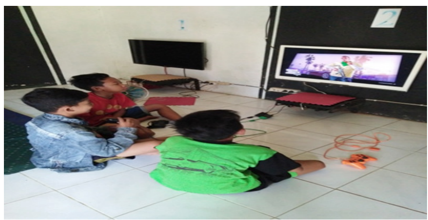
Figure 3. Always playing video game together in village