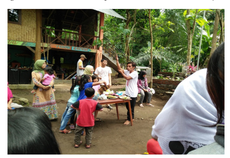
Figure 7. The Tanoker Inscription which was established 13 years