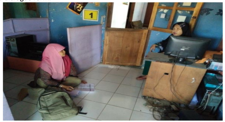
Figure 5. Interview with parent

In RPG games, levelling up is the main motivation, some RPGs even ask players to engage in what is known as "level grinding" which takes a long time to do and fight enemies for the purpose of levelling up. Most players think that what makes RPGs different with other games is that they have a complicated storyline that involves a large number of players in character dialogue form.