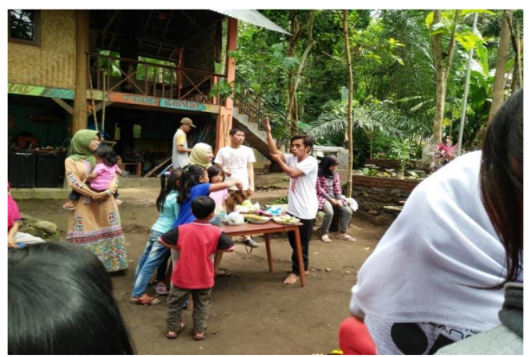
Figure 8. Happy Sunday Activity with the theme of cooking

Being involved in the "Happy Sunday" activity organized by the Tanoker Community, every Sunday is a very pleasant thing. It begins with gymnastics along with an upbeat song instrument. After participating in gymnastics together, then following routine activities such as competitions, cooking, reading books, and so on. In the picture above, a Tanoker Community volunteer explains that this routine activity was originally formed by seven activity forums consisting of reading and writing, playing traditional games, cooking, doing sports, singing a song, listening to music, dancing, and painting.