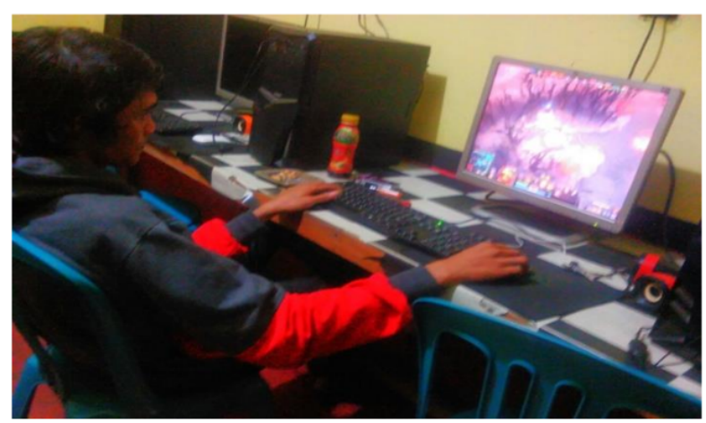
Figure 4. Playing in City