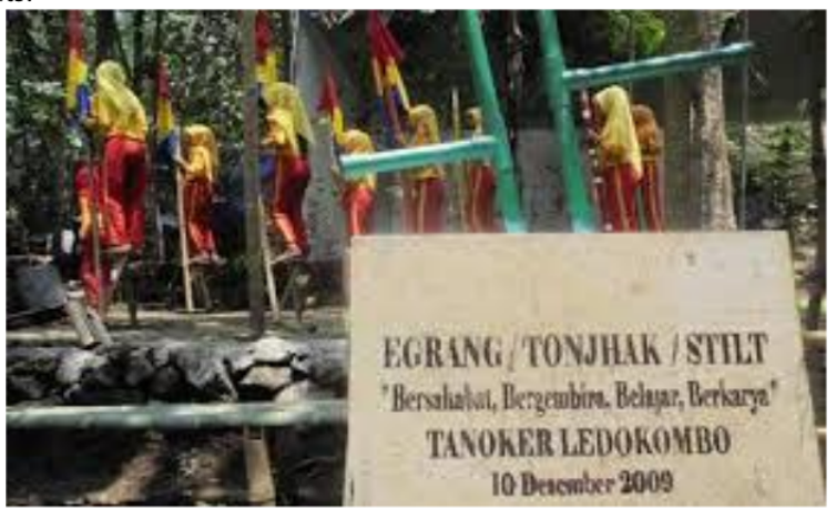
Figure 7. The Tanoker Inscription which was established 13 years

The motto of Tanoker, which is to be friendly, to have fun, to learn, and to work, 'friendly' theme gives us an understanding that the Tanoker Community always prioritizes friendship with anyone regardless of background, ethnicity, race and so on, and having fun is the right of the children. The Tanoker community always wants to learn and to share knowledge and experience, learning makes changes for the better, and then working. This community grows and develops with innovative works that give benefit for the surrounding environment. The cultural theme is a reference in encouraging rural social change in Ledokombo District. Starting from the traditional game of stilts, Tanoker which was established on December 10, 2009 and located about 15 meters after the three intersection monuments in Ledokombo Village, became an interesting place for various scientific studies. From that name, they aspire to develop from a cocoon which is considered ugly and disgusting, but it turns out after metamorphosed, it can become a butterfly with a charming colour, and it can fly everywhere, so many people will like it. The deeper they interpret the name, the more eager they want to carry out activities as evidence that even though they are part of the village children, their creativity does not want to be outdone by the children in the city. They want to realize and intend to perform in various areas, especially with the game of stilts.