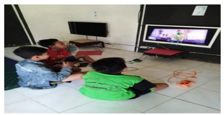
Figure 3. Always playing video game together in village

motivators are curiosity and exploration, ownership, autonomy, competence, and goals/plans.