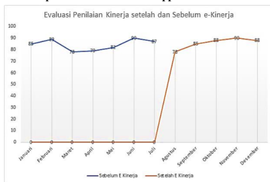
Graph 1 2020 Performance Appraisal Evaluation

Some of the benefits that will be obtained if the e-Kinerja system is implemented properly and as well as possible will not only be felt by ASN and agencies. With the monitoring of work through e-Kinerja, it can also indirectly have a good impact on the community or the public. These are some of the benefits that will result from the implementation of the e-Kinerja system properly, services to the public or the community will be better as a result of the increasing quality of work of ASN; The implementation of the government system within the agency or OPD will be more efficient and effective so that it is expected to get better outputs; Supervision of the performance and activities of ASN will be easier and more structured; It is easier to evaluate the work and achievements of ASN which will later be used to provide rewards and punishments to those concerned; As the basis for determining the amount of salary, automatic promotion (KPO) and also the automatic retirement process (PPO) for ASN; Assist in the creation of good and clean governance or good governance within government agencies and OPD; Assisting administrative transparency because all non-confidential letters must be uploaded to the e-Kinerja website; Facilitate the provision of allowances to ASN whose amount will be determined based on the results of the assessment and achievements contained in e-Kinerja; Stimulating ASN to be able to work better, more professionally and with dignity.