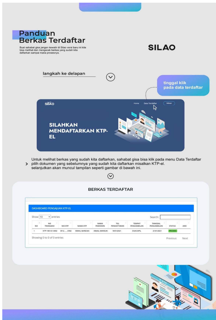
Figure 3. Guide for Registering a Document

A guide for registering a document, showing steps and guides for registered files. To see the files that we have registered, you can enter the registered data menu, then a display will appear as shown in the picture.