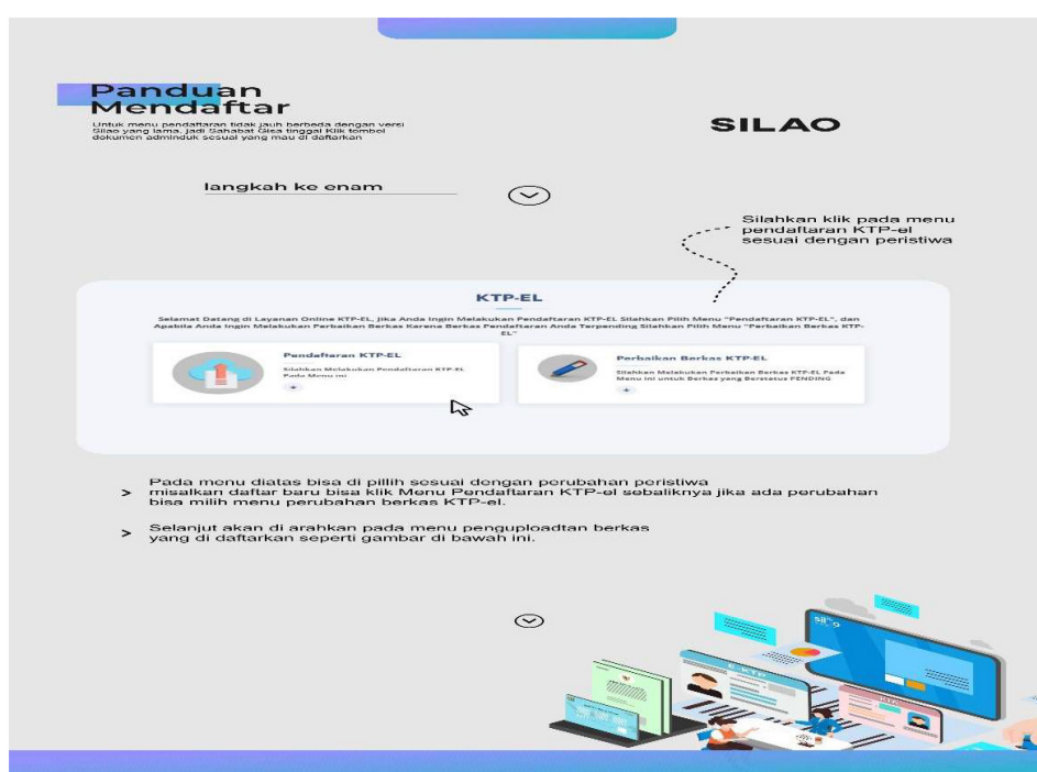
Figure 1. The Registration Instructions

Restrictions on Emergency Community Activities (lockdown) is a regulation that the government has implemented in order to protect the public from the 2019 Corona Virus Disease. Face-to-face services will be updated in accordance with the Population and Civil Registry Service's online services policy up until an unspecified time restriction expires. e-ID, family cards, civil registration certificates, child identity cards, change of address, arrival, and data synchronization are among the online services available. Situbondo's Population and Civil Registration Office is creating an online system for population administration service information (SILAO). Beginning on March 24, 2020, this program is in operation. In the midst of the ongoing pandemic, SILAO is designed to make it easier for applicants to register with the public population administration by avoiding the need for them to physically visit the Population Civil Registration Office. This is a guide for logging into SILAO. The Population and Civil Registration Office in Situbondo Regency is one of the regional organizations that offers population management services, including family cards, identity cards, birth, death, marriage, and divorce certificates.