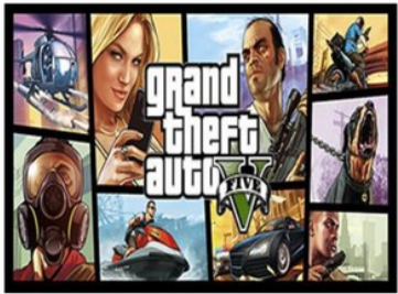
Picture 4. Display of GTA 5

Some problem he faces related to using English is when he has to speak directly with other persons. He worries about his grammar. But when he will be more confidence when he has to use English in written since he can check the grammar before he sends the messages.