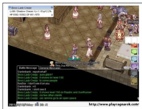
Picture 3. Communication between the players of video game through fitur chat (Ragnarok Online)

The numbers of stimuli in English whether it is online or offline can be one of the tools to learn English while it is also regarded as recreational activities. The players will be indirectly motivated to learn English by self finding new words they meet on the game, whether it is oral or in written. The players will be automatically do Discovery Learning when they play the game. Playing game is one of fun activities for them and it can be a special stimulation for them to understand the game in depth. When they do not understand what happen in the game, they will have a problem. But they will try to identify the problem, whether because of language aspects they do not understand or, they do not understand how the game works.