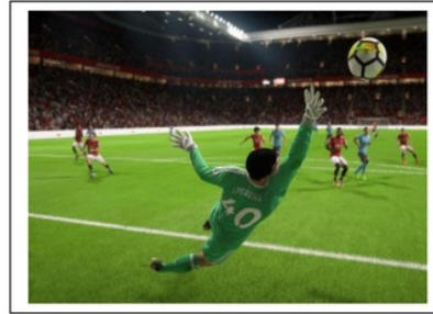
Picture 5. Gameplay FIFA 18