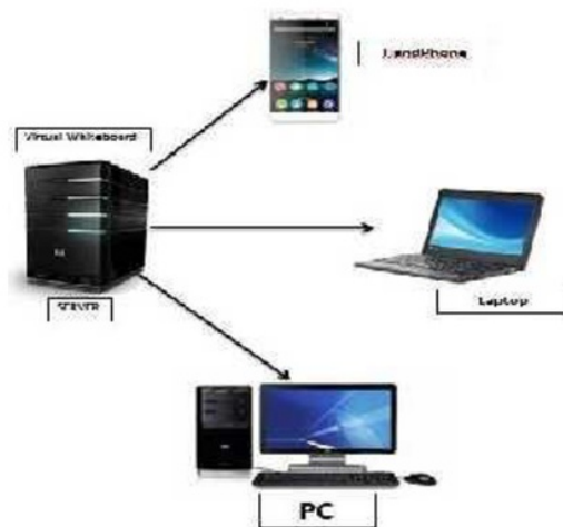
Figure 3 Client Server Topology Client

In Figure 2 can be explained that there are flowchart virtual whiteboard system in general. Can be explained that the first step in a virtual whiteboard system in general is input user ID and password into the system, the next step is the system will read the ID and password that have been fed with correction of ID and Password. If the ID and password are correct, the system will directly enter the web dashboard, and when the ID and password is not correct then the system will loop back to the login input. Use-case diagram to explain feature of the system as seen as people who are outside the system or actor. The design process that occurs in virtual whiteboard system can be described in the figure 2. This system topology is the topology that is used to run virtual whiteboard where this topology there is a server and client, the server uses a computer that serves the client computer requests by providing resources such as more memory, hard drives with high capacities. The topology present in figure 3 below.