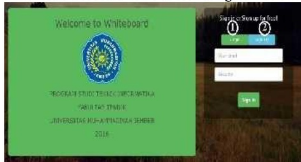
Figure 4 Home webboard

The result webboard home as seen at figure 4 below.