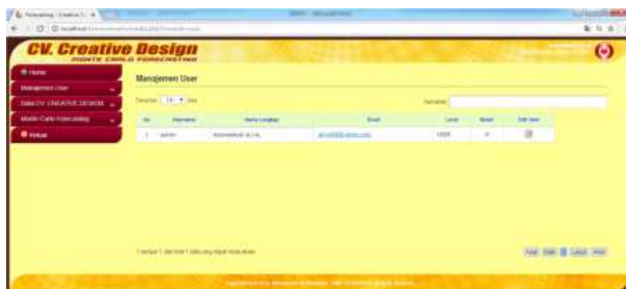
Gambar 4.6 Implementasi Tampilan Halaman Master Level User