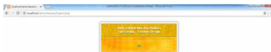
Gambar 4.14 Implementasi Tampilan Halaman Logout