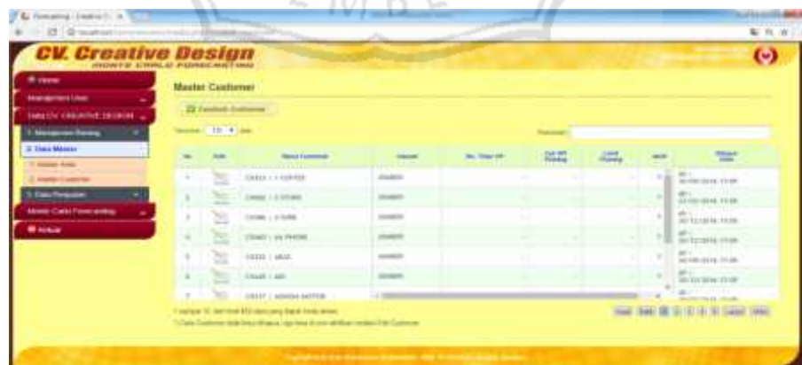
Gambar 4.9 Implementasi Tampilan Halaman Master Customer