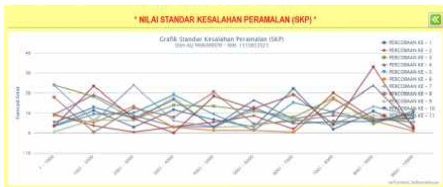
Gambar 4.15 Grafik Standar Kesalahan Peramalan (SKP)