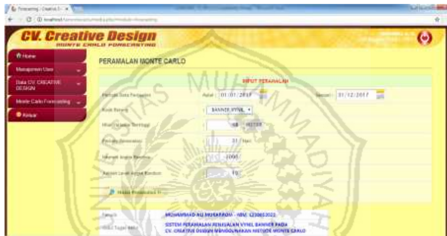
Gambar 4.12 Implementasi Tampilan Halaman Input Peramalan