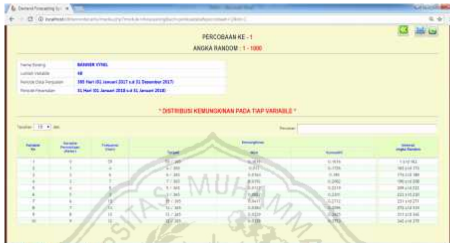
Gambar 4.13 Implementasi Tampilan Halaman Perhitungan Peramalan Produk