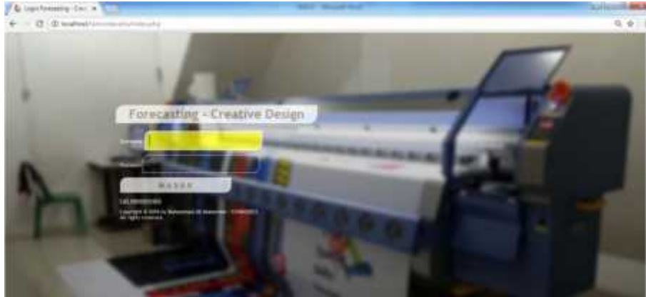
Gambar 4.4 Tampilan Halaman Login