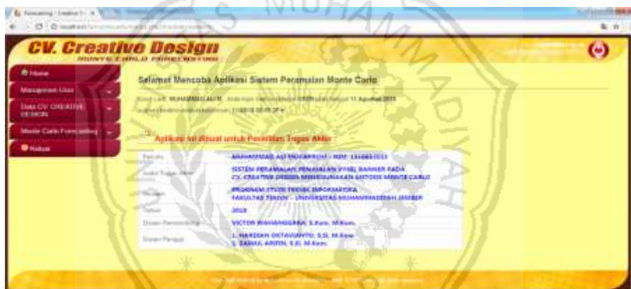
Gambar 4.5 Tampilan Halaman Beranda