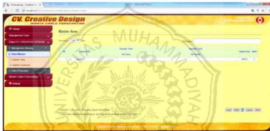
Gambar 4.8 Implementasi Tampilan Halaman Master Area