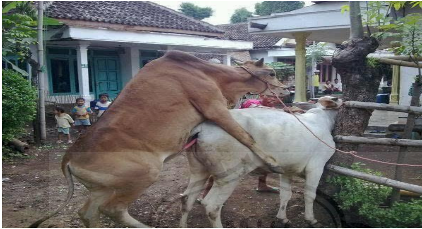
PROSES KAWIN ALAMI