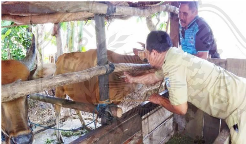
MEMBERI OBAT CACING KEPADA SAPI