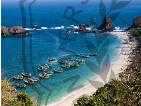
2. Watu-Ulo beach