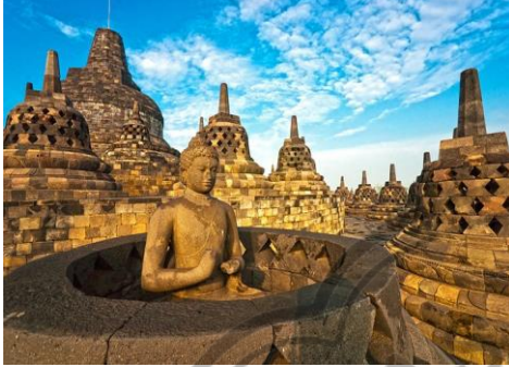
1. Borobudur temple

Choose one of these following historical buildings and tourist attractions below. Then, describe it into 10 sentences.