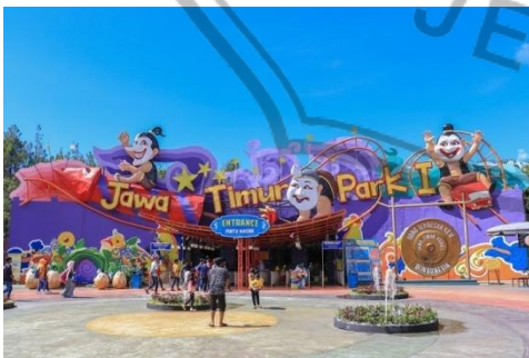
5. Jatim Park