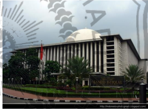
4. Istiqlal mosque