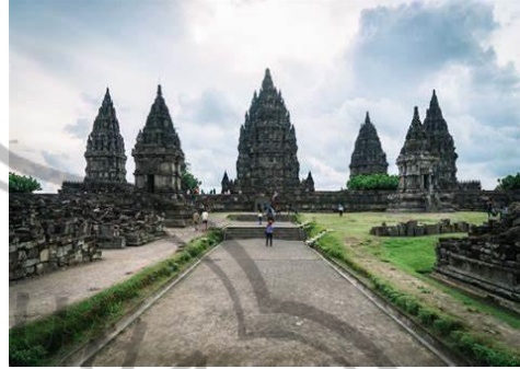
3. Prambanan temple